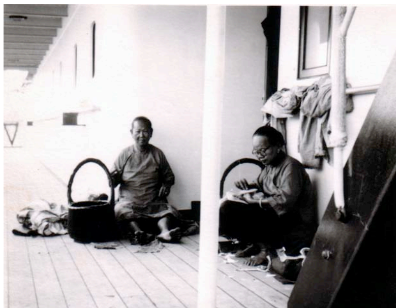
"Sew – Sew" women on promenade deck in Singapore

(Association Football. DIOMED v Malay cadet ship "KAJANG". WON 6-3)