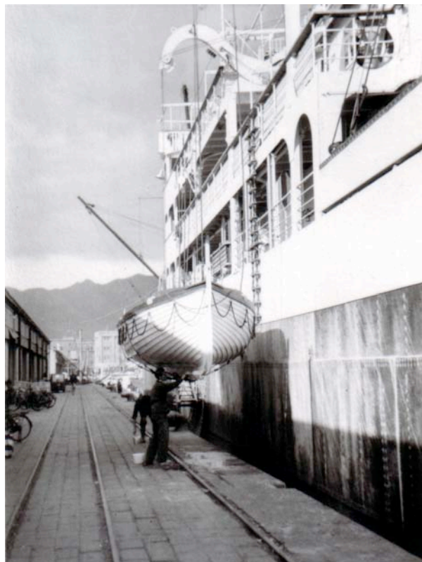
Dave Eves painting No. 2 Boat in Kobe

0630 call. Centrecastle deck washed down. Two derricks topped at No. 3 hatch. Stand by to arrive outside Kobe breakwater at 1300. Anchor cable broken, and spare links shackled on. Made fast to buoy by 1345.