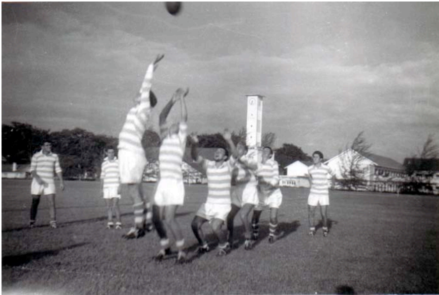
Half an hour after knocking off. A practice line-out before the game

0530 call. Stand by to move alongside at 0600. Derricks lowered to stevedores' requirements. Funnel stays given a coat of white lead and tallow. Fidley paintwork washed. Poop standing derrick overhauled. Starboard fish plates and stanchions painted. Forecastle head ladder steps bound with rope strands. Starboard half-round scraped to bare metal in parts, given one coat of red lead and painted white. Lifeboat fall guards on boat deck wire brushed and red lead applied. (Mr Shorrocks 3 / 0 to hospital). (Rugby Football. DIOMED v "A Malay School" WON 19-5).