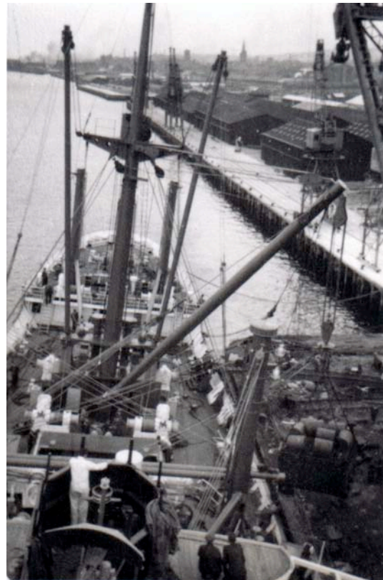
Ship lists as "Jumbo" lifts 77 tons