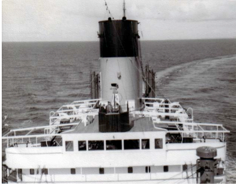
Glasgow – Birkenhead with guests aboard