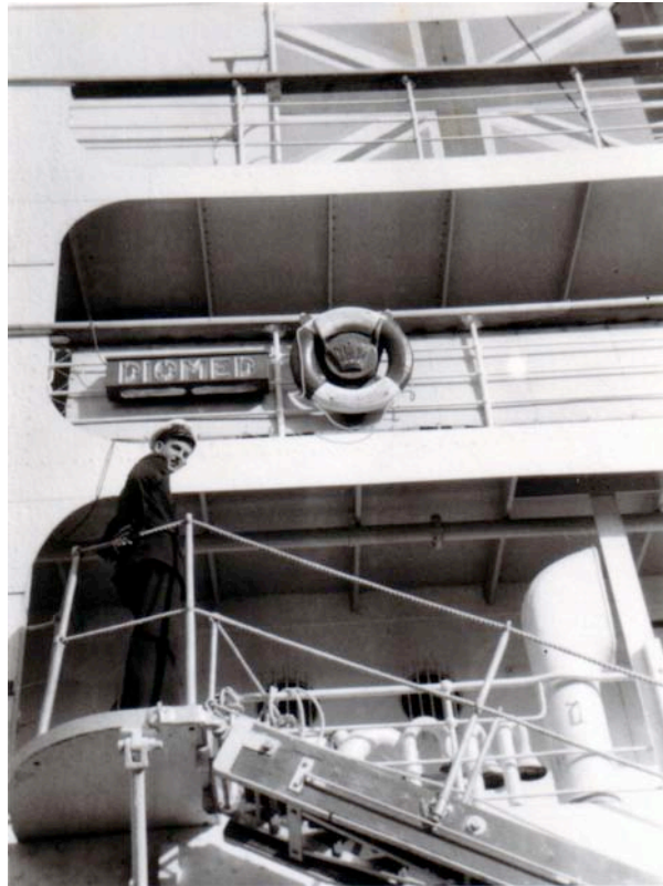
Gordon Simpson – Gangwayman – Kobe

0530 call. 0600 stand by to move alongside. 0730 alongside. Gun tackle rigged at No. 2 hatch. Port lifeboats lowered to wharf, washed and outboard sides painted, also davits. Fore, lower mast painted.