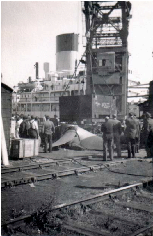
130-ton crane, lifting 77 tons, ready for heavy derrick test

For'd ropes. Davies. Cooper. Borrowdale. Elder. Keith 6 / 0 Aft ropes. Clarkson. Carter. McKiernan. Steele. Brough 5 / 0 For'd wires. Watch to go on. Aft wires. Watch previous. Mess. Piper. Accommodation. Elder.