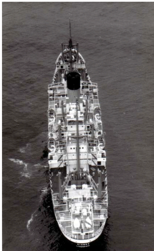
Dundee – Glasgow. Stopped for anchor trials